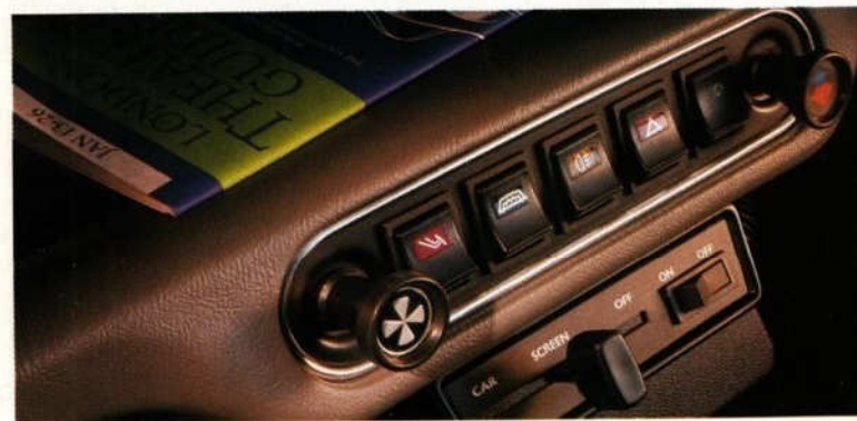
Mini switch panel