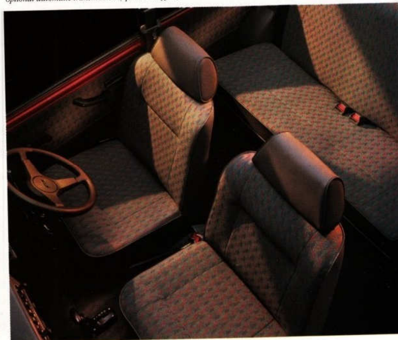
Mini Sprite interior

▼▼ It is a joy to drive with its tremendous grip, performance and handling. ▲▲