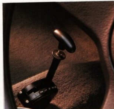
Optional automatic transmission (Sprite & Mayfair)