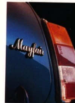
Mini Mayfair rear badge