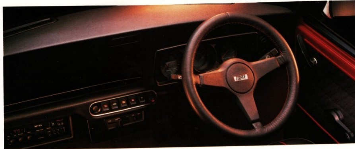
Mini Cooper 1.3i fascia

Today's Mini Cooper 1.3i was developed by Rover Cars with John Cooper, naturally. It has the 1275cc power unit that became famous in Cooper 'S' models; with the modern