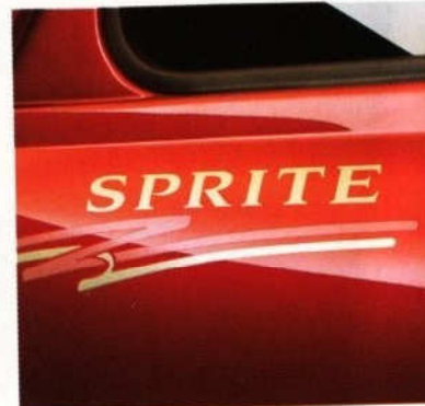
Mini Sprite side decal

refinements of single-point electronic fuel injection, and a three-way controlled exhaust catalyst. The performance is as breathtaking as ever, beating all small car competitors in its class with a 0-60 time of 11.5 seconds*.