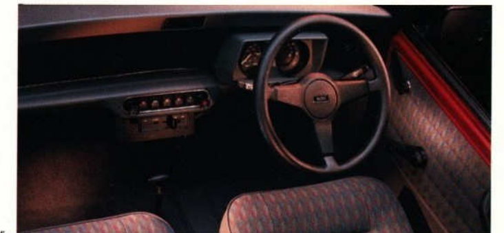
Mini Sprite interior