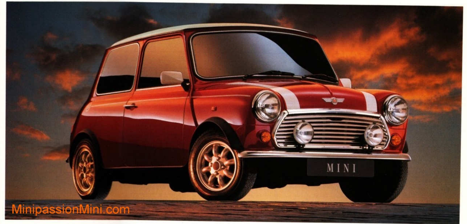
Mini Cooper 1.3i

'Auto Express' - March 92 - Mini Cooper 1.3i