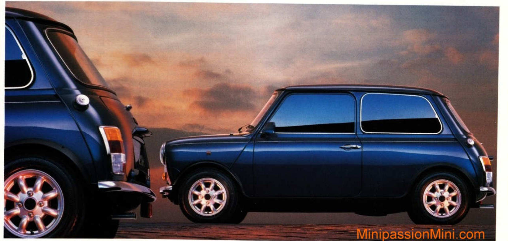
Mini Mayfair with optional alloy wheels