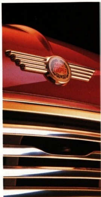
Mini Cooper 1.3i bonnet badge