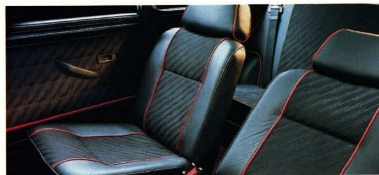
Mini Cooper 1.3i interior